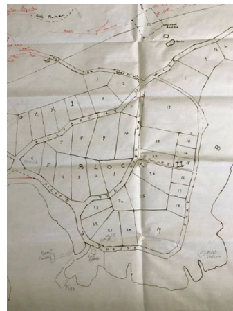
Caption: Caulfeild map (part), 1907 (054.WVA.CAU).