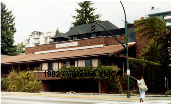
YMCA in the old Post Office, 1982