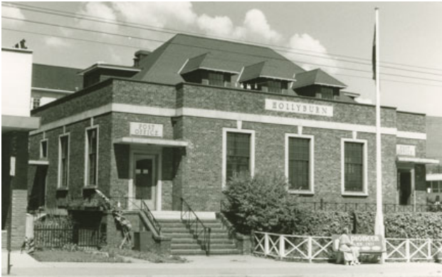
Post Office 1955