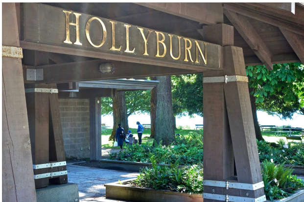
John Lawson Park Kiosk 2019