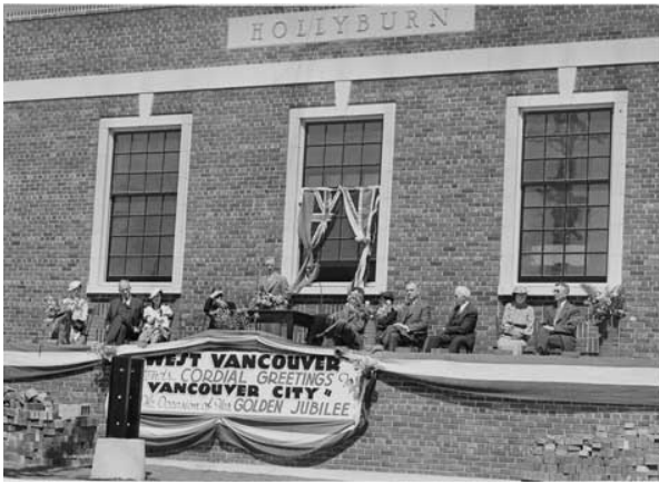
Post Office Opening Day, August 12, 1936