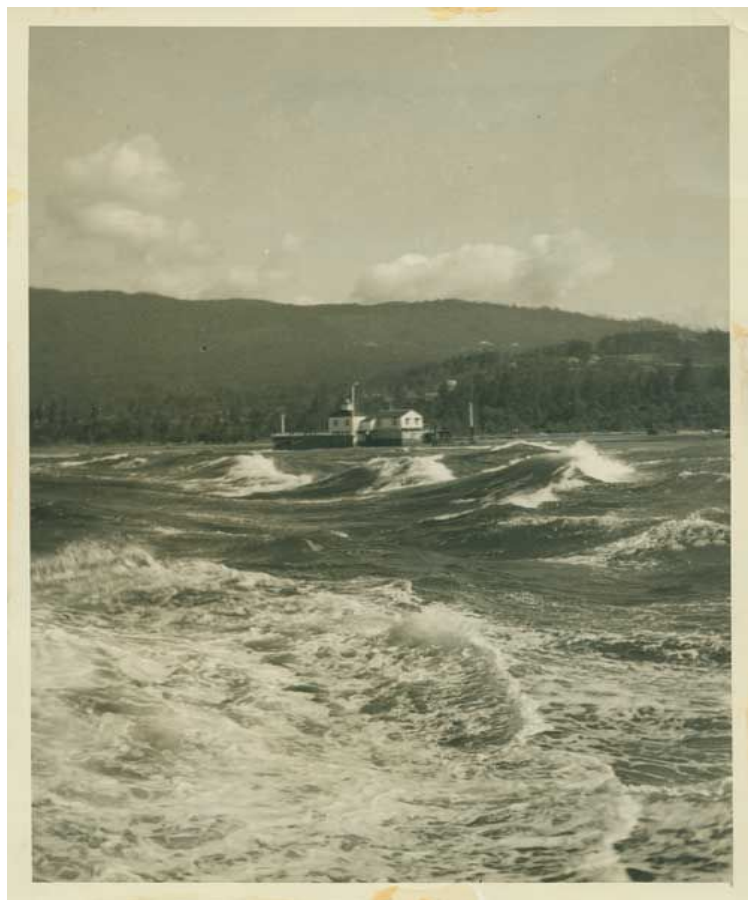
Photo Credit: Gordon C. Odium, 1932, WVA Capilano Fog and Light Station at the mouth of the river

We trust that all of you are well and we look forward to seeing you at future meetings when normal days return.